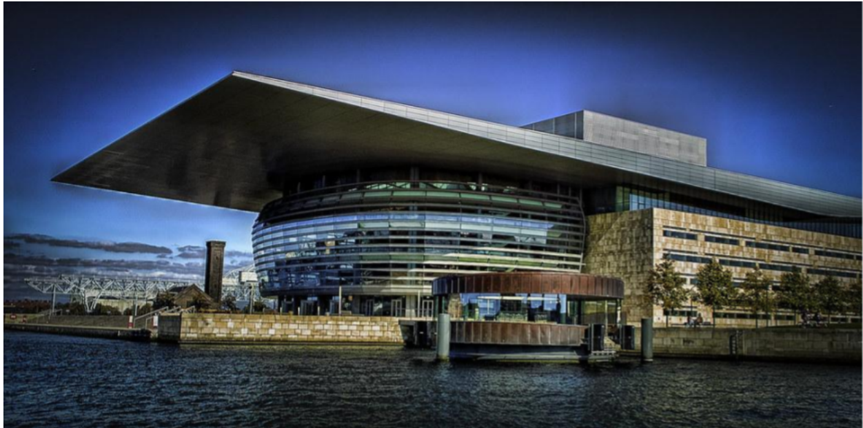
Copenhagen's modern opera house (opened 2005) stands across the harbor from the Amalienborg royal palace