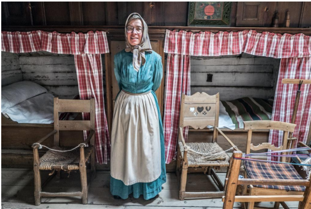
One of the docents at Skansen folk museum

*Note: Stockholm has discontinued its official city pass, though you can find private versions of that card online for prices similar to what the public version costs in Oslo and Copenhagen.