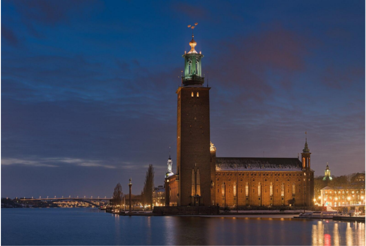
Stockholm's City Hall (Stadshuset) features a 106-meter tower, slightly (and intentionally) taller than its cousin in Copenhagen