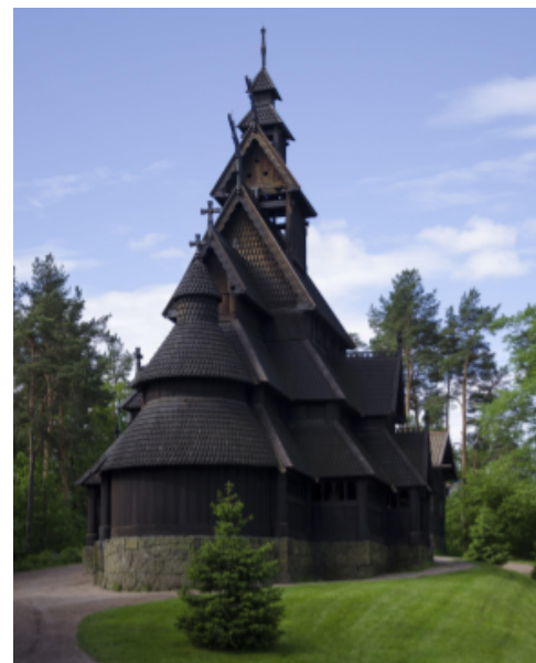
One of Norway's 28 surviving "stave" churches was moved to Oslo's folk museum in 1884