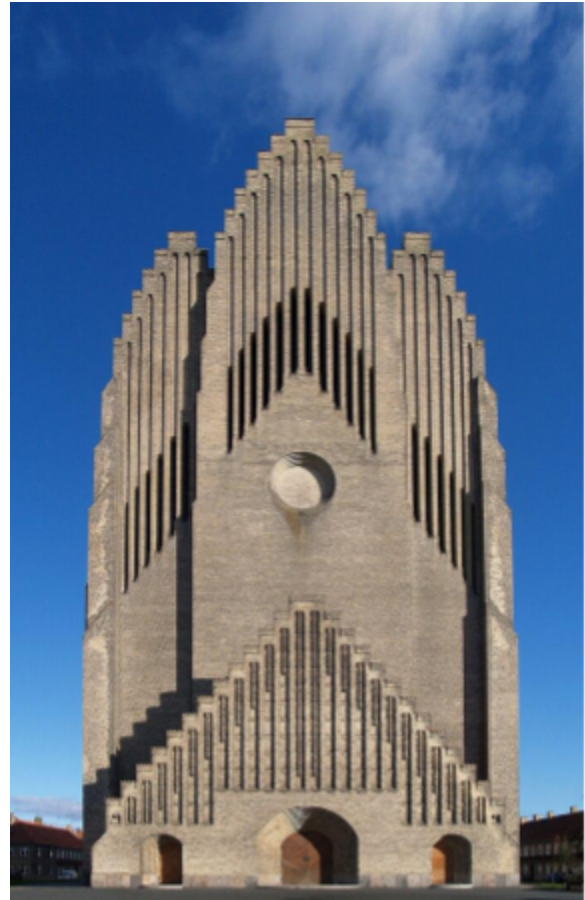
Grundtvig's Church in Copenhagen is named for N.F.S. Grundtvig, a key figure in 19th c. Danish nationalism